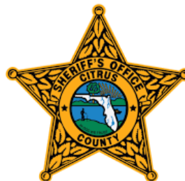
Citrus County Sheriff's Office