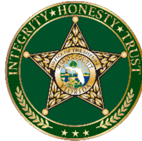
Marion County Sheriff's Office