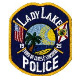
Lady Lake PD