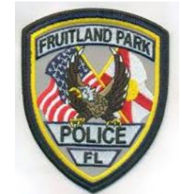
Fruitland Park PD