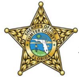
Sumter County Sheriff's Office