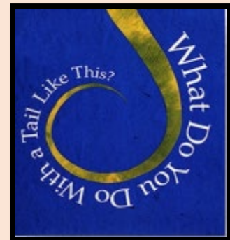
“What Do You Do With a Tail Like This?”