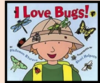
“I Love Bugs!”