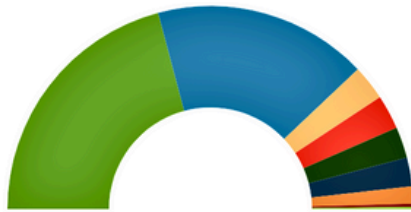
Expenditures by Function - City Wide

Wildwood's current millage rate of 2.8287 is the lowest in the city's history.