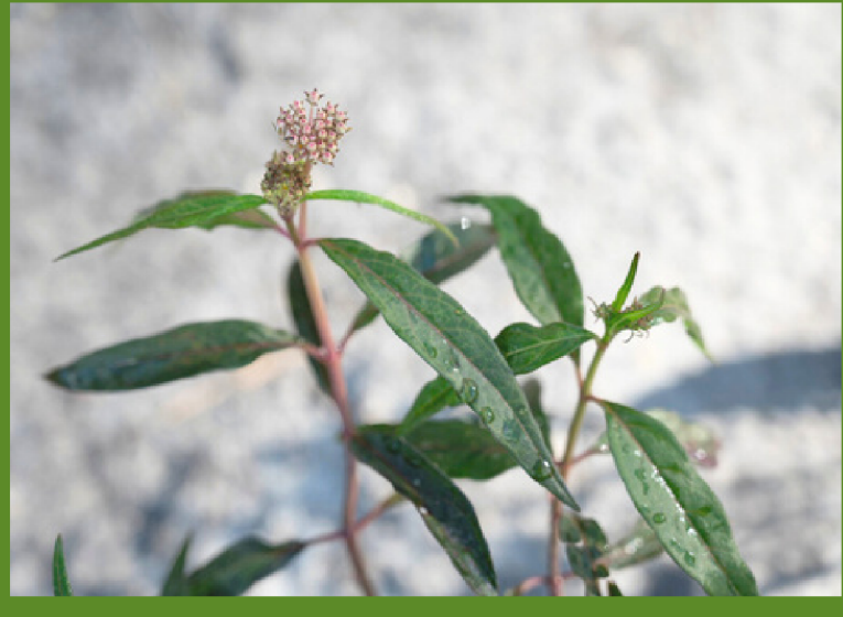
Below: Buds on aquatic milkweed, Asclepias perennis , planted in the garden to feed monarch caterpillars.