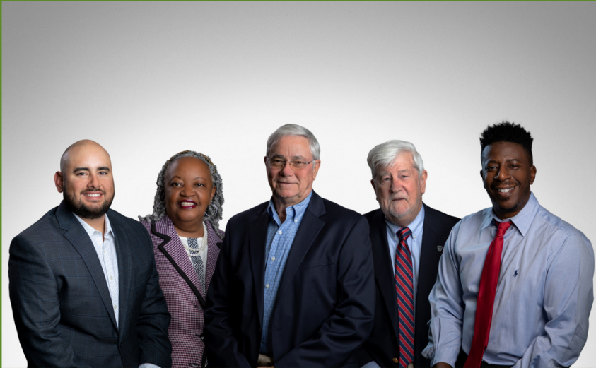
Above: Wildwood's five-member city commission.