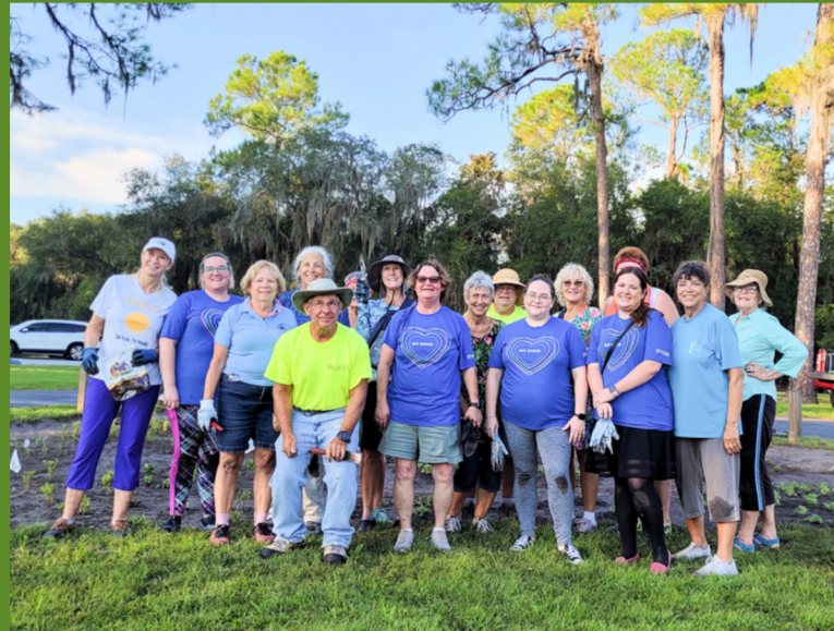
Above: Volunteers on planting day.

Find Wildwood's pledge and learn more about monarchs at nwf.org/mayorsmonarchpledge .