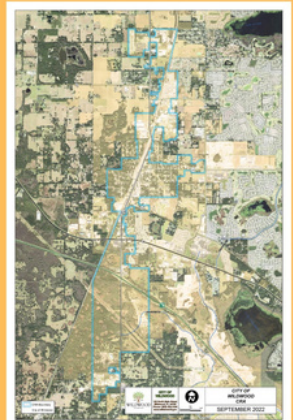
CRA area shown in blue (see website for map detail)