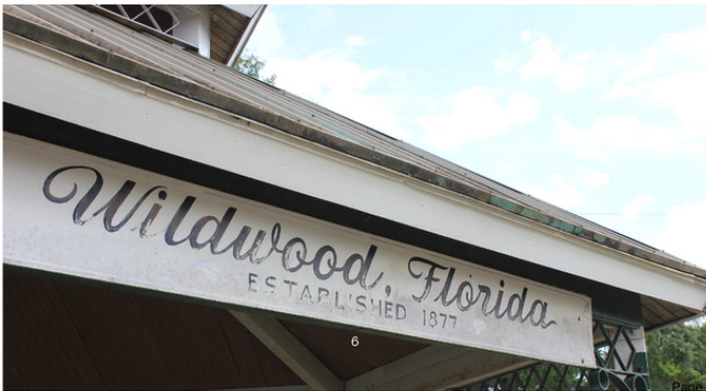
Page 7 of 154