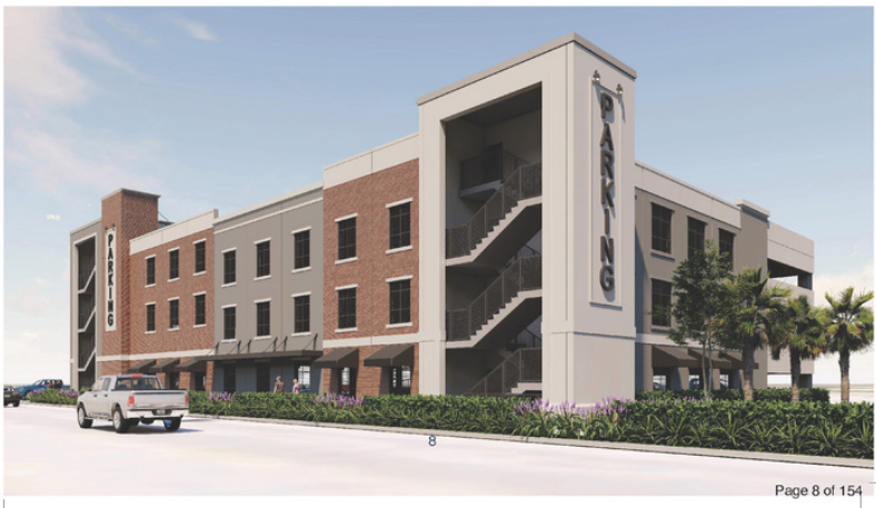
Page 8 of 154

Contractual negotiations are underway, with planning and design expected to move forward on both projects this spring.