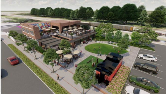
THE GARAGE WILL PROVIDE PARKING FOR EXISTING BUSINESSES AS WELL AS THE NEW COMMERCIAL DEVELOPMENT.