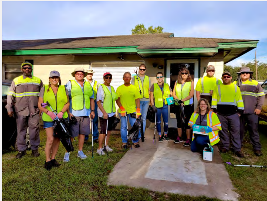
The Wildwood Street Sweepers at MLK Jr. Community Center

For more information, including how to get involved, call 352-661-6067 or email ttradd@wildwood-fl.gov .