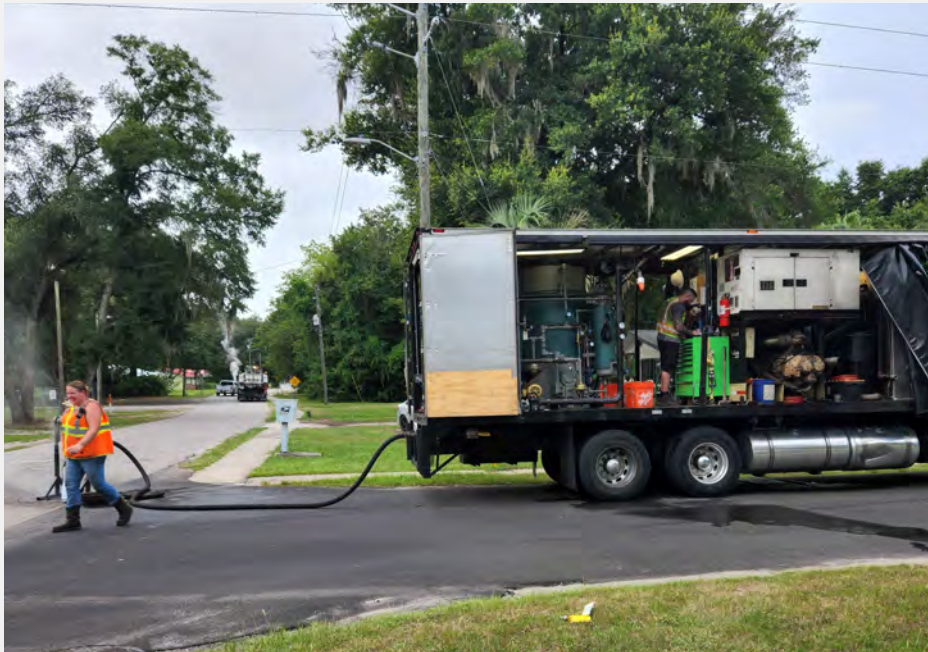
Shown below, both left and right, are pictures of the team in action.

The pipe reconditioning was undertaken in advance of new pavement scheduled for the area in 2024.